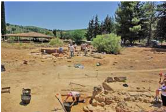
Excavations, with the bath in the background

vate around the hero shrine at Nemea! We were looking for evidence of life at Nemea in the Prehistoric and Geometric periods, that is before about 750 B.C., as well as how the shrine developed in the Archaic Period (750-480 B.C.) and later. As always we were alert to learn anything we could about the area around the shrine.