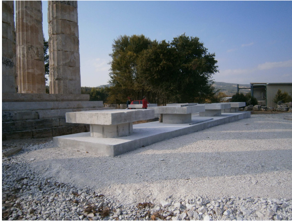
The “L-shaped” foundation—epistyles will be placed so they can be worked at ground level.

oes in its dimensions, the dimensions of the actual temple. The epistyle blocks will be put into place on top of these copies first so that any difficulties can be fixed at ground level rather than at a height of two stories in the air. It will also permit visitors, for a short time, to see the full epistyle close-up.