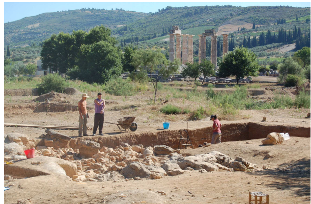
Excavations with the temple in the background.

As has become a somewhat frustrating saga, the summer began with great uncertainty about our permit to work at Nemea. Recent political-economic problems in Greece combined with bureaucratic issues to delay the positive processing of our government permit. But thanks to members of the Central Council in the Ministry of Culture and the Director of the American School of Classical Studies in Athens, we finally received the permission we needed to exca-